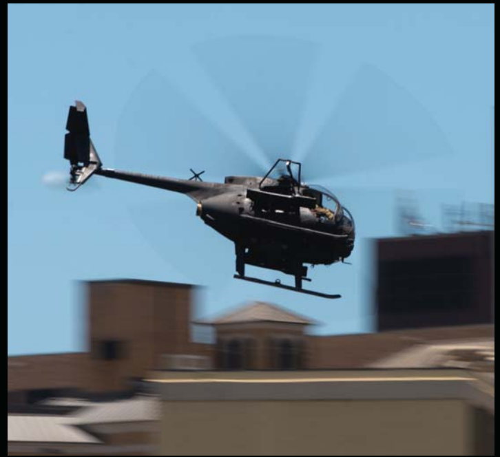
Multinational special operations forces aboard an MH-6 Little Bird helicopter and a Special Operations Craft – Riverine boat approach a simulated enemy position during 2018 International Special Operations Forces week in downtown Tampa, Fla., May 22.