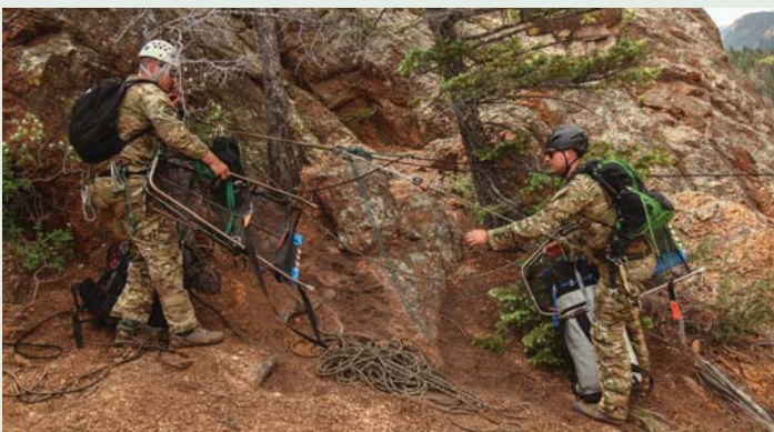
(Above) Green Berets, assigned to 10th Special Forces Group (Airborne), prepare to haul rescue equipment across a canyon using a rope system during personnel recovery training at Cheyenne Canyon, Colo., June 6.