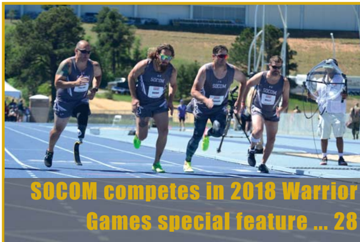
SOCOM competes in 2018 Warrior Games special feature ... 28