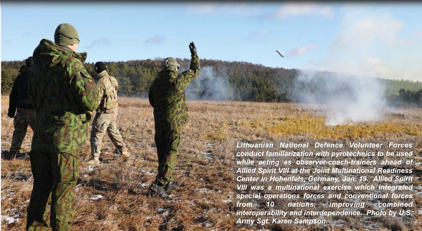
Lithuanian National Defence Volunteer Forces conduct familiarization with pyrotechnics to be used while acting as observer-coach-trainers ahead of Allied Spirit VIII at the Joint Multinational Readiness Center in Hohenfels, Germany, Jan. 19. Allied Spirit VIII was a multinational exercise which integrated special operations forces and conventional forces from 10 nations; improving combined interoperability and interdependence.