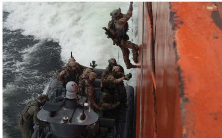
U.S. and Danish maritime special operations forces board a ship in the Baltic Sea during exercise Trojan Footprint 18 June 4.

"Estonia is one of the very few countries in NATO who have integrated unconventional warfare plans into its standing defense plans. ESTSOF together with specific EDL units has