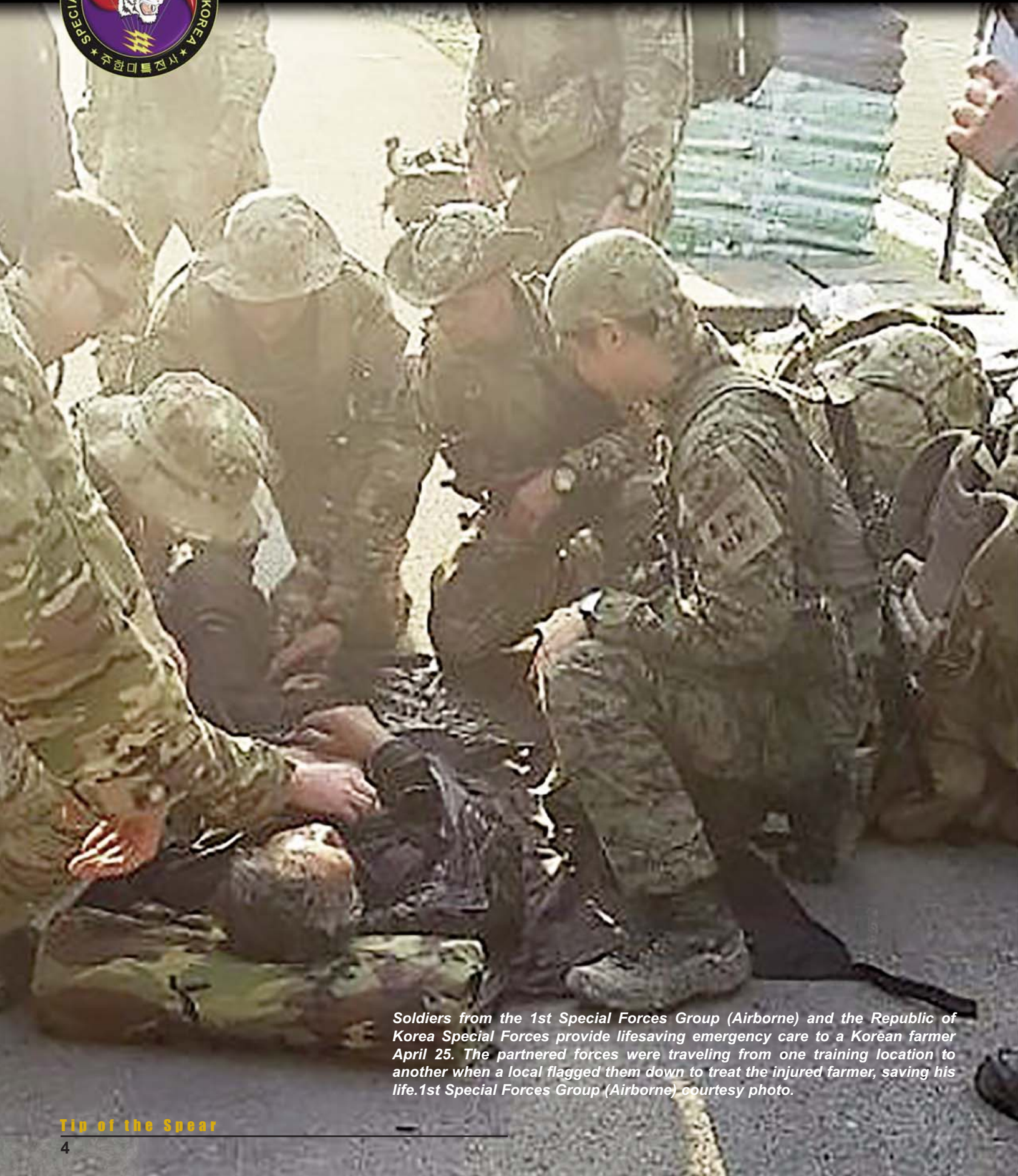
Soldiers from the 1st Special Forces Group (Airborne) and the Republic of Korea Special Forces provide lifesaving emergency care to a Korean farmer April 25. The partnered forces were traveling from one training location to another when a local flagged them down to treat the injured farmer, saving his life.