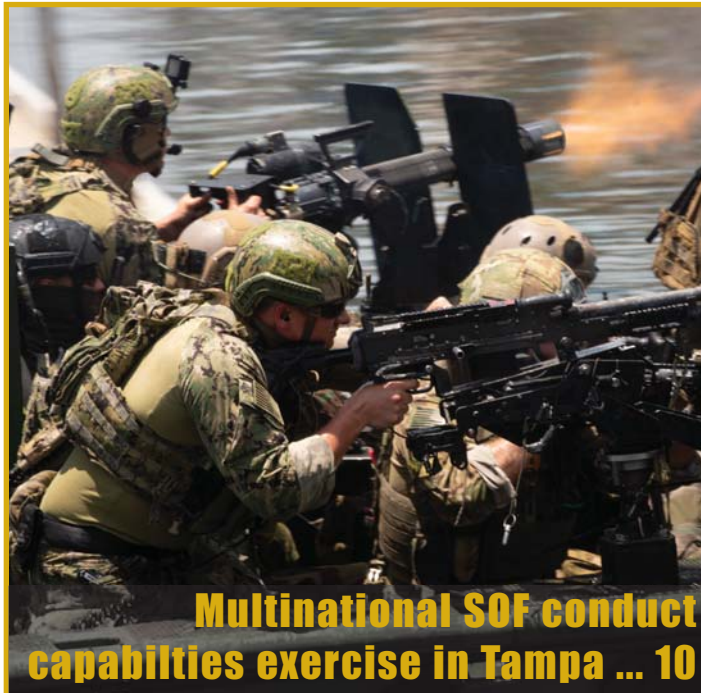
Multinational SOF conduct capabilities exercise in Tampa ... 10