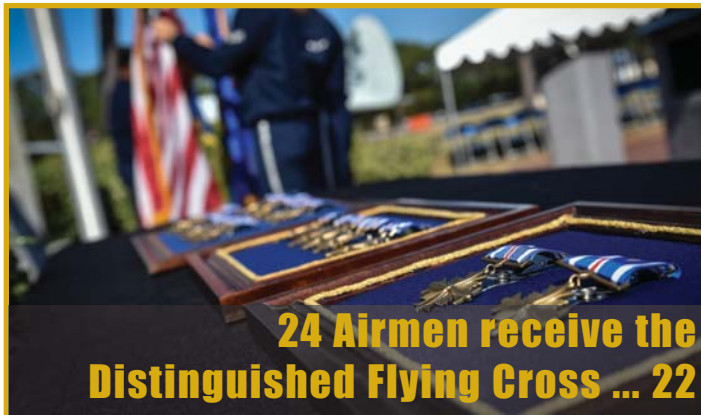
24 Airmen receive the Distinguished Flying Cross ... 22