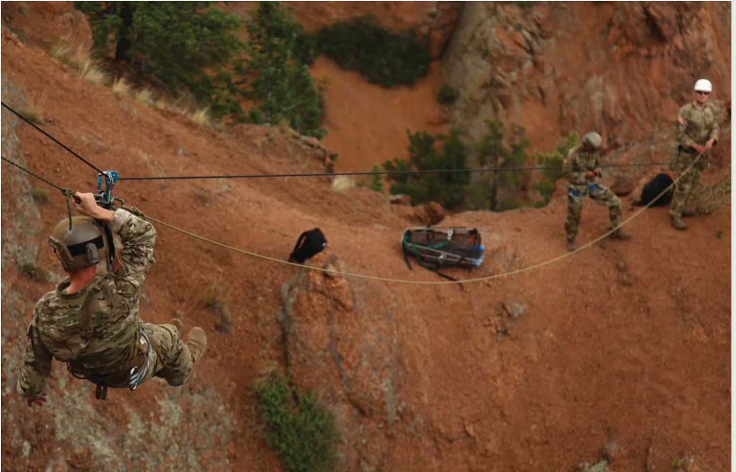
A Special Forces team pulls one of their Green Berets across a canyon using a rope bridge during personnel recovery training at Cheyenne Canyon, Colo., June 6.