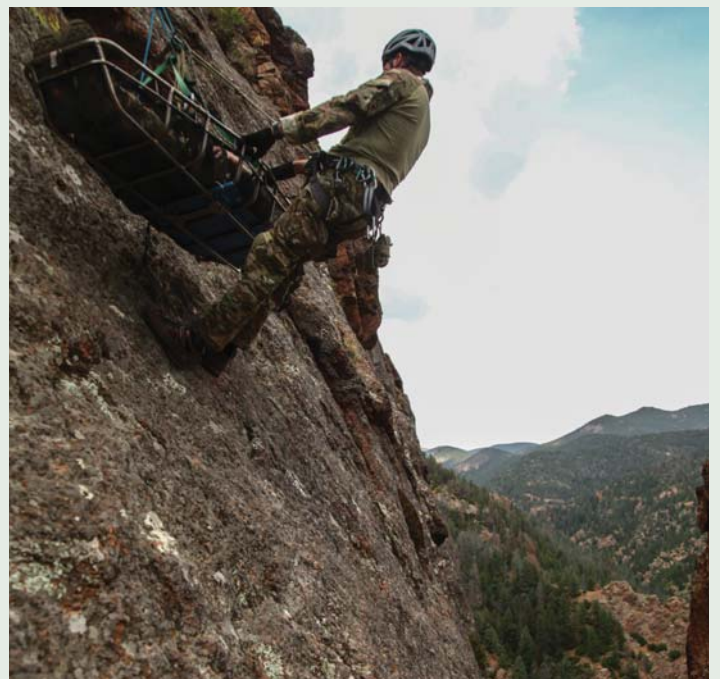
(Right) A Green Beret assigned to 10th Special Forces Group (Airborne), ascends a canyon wall with a mock casualty during personnel recovery training at Cheyenne Canyon, Colo., June 6.