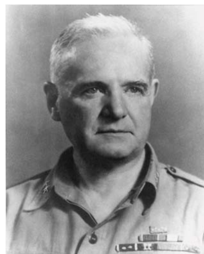
Maj. Gen. William J. Donovan when he headed the Office of Strategic Services.

After the war, Donovan wanted to become more involved with the government. He served on many different federal commissions and delegations. He also unsuccessfully campaigned for lieutenant governor and governor of New York in 1922 and 1932, respectively. His business also took him frequently abroad, and Donovan’s extensive travel experience brought him to the attention of President Franklin Roosevelt, who asked him to visit