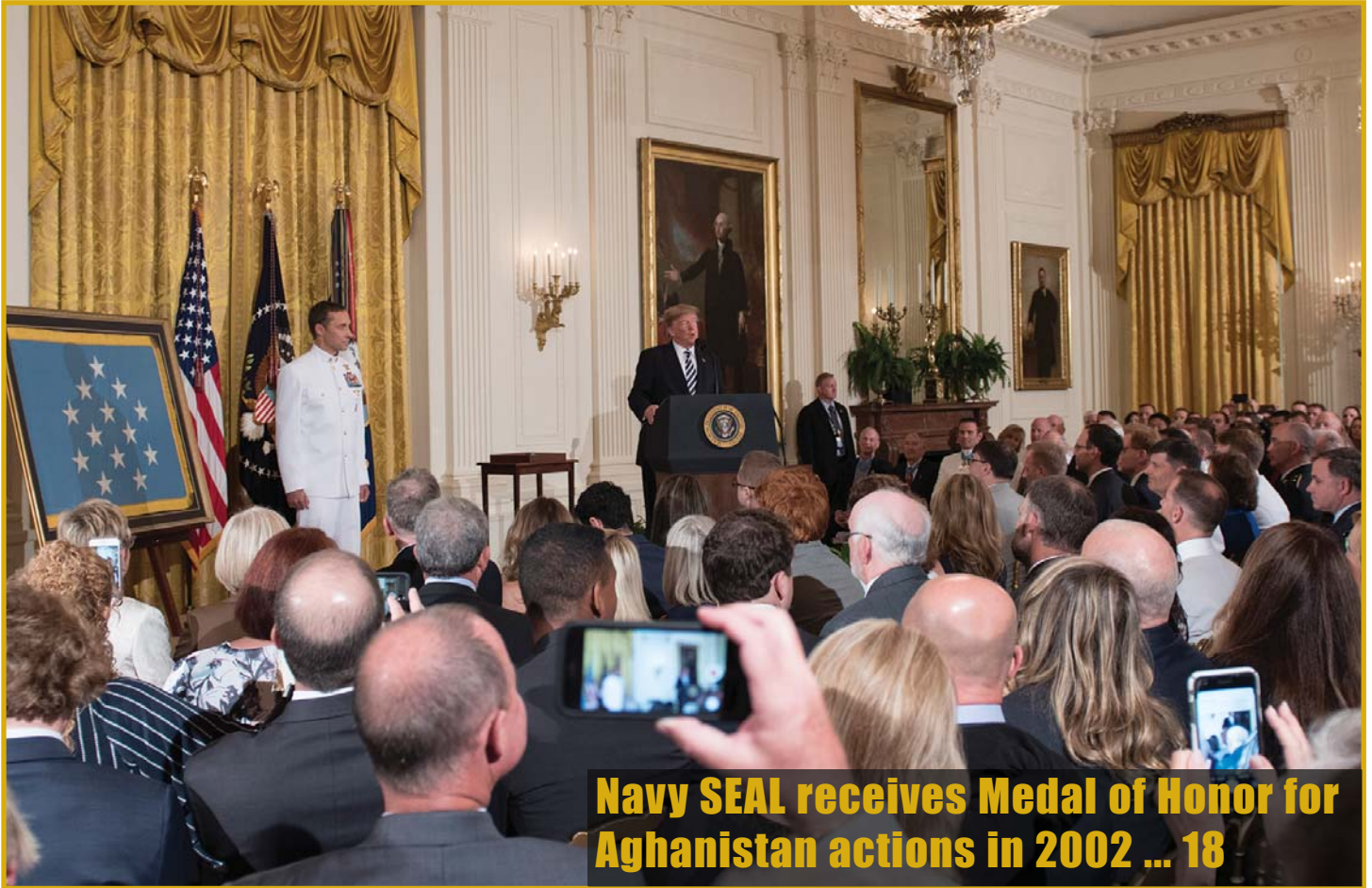
Navy SEAL receives Medal of Honor for Afghanistan actions in 2002 ... 18