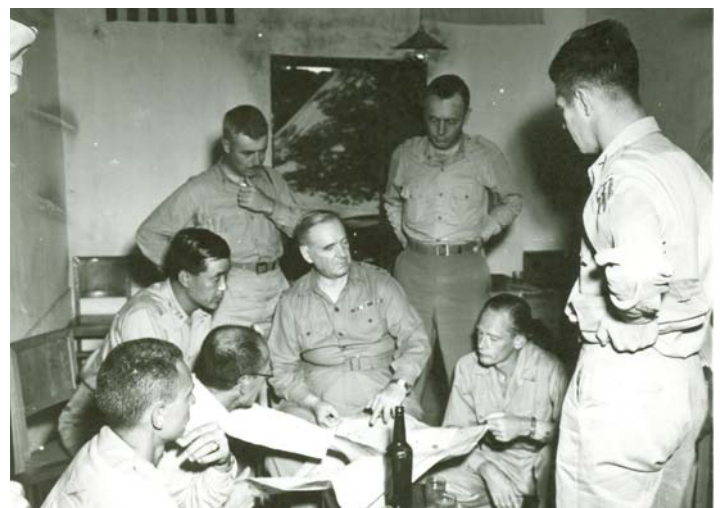
William J. Donovan briefing a plan during World War II.

Donovan retired from active duty and returned to his work as a lawyer. His first job after the war was serving as an aide to the U.S. chief prosecutor at the Nuremberg war crimes trials. He died at the age of 76 on February 8, 1959 at the Walter Reed Army Medical Center, in Washington, D.C. He is buried in Arlington National Cemetery.